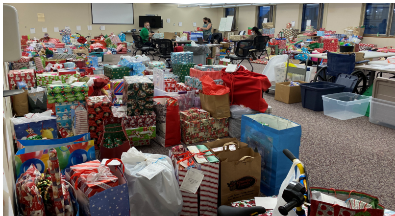
Pictured above is a snapshot of the gifts received for the 2020 Community Elves Program. The River Block Auditorium was full of presents for families and children to receive in Wood County.

Community Elves Program: The Wood County Community Elves Program, formerly known as the Holiday Cheer Program, was a real miracle! As we all know, 2020 was full of unknowns and unrest. The Community Elves Program wanted to be sure that the children in Wood County would have something special to open during Christmas. With the help of many generous sponsors, employees of Wood County, and the community of Wood County, the elves were able to help over 700 individuals and families. A record 3,000 gifts flowed in and out of the building, making their way to well-deserved homes. Many grateful tears and tokens of appreciation were received! We look forward to continuing this program for many years to come and ensuring community members that the elves are always looking out for them to lend a hand whenever needed. Please see below for some of the pictures taken in connection with the program. We appreciate the efforts of those in the captured pictures as well as many more staff who contributed to program efforts.