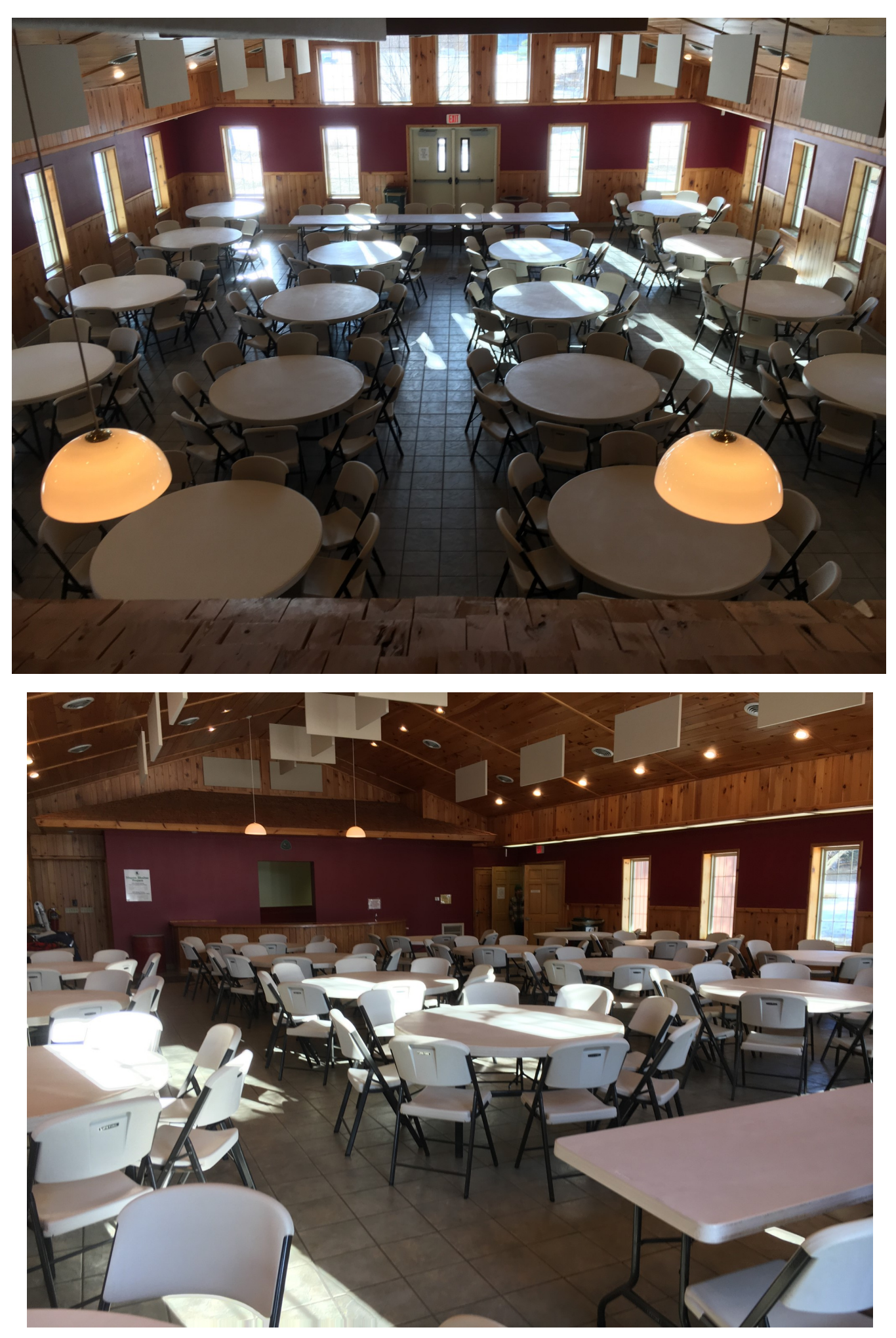
L:/parks/brochures/shelter brochures/Nepco Shelter Brochure.pub